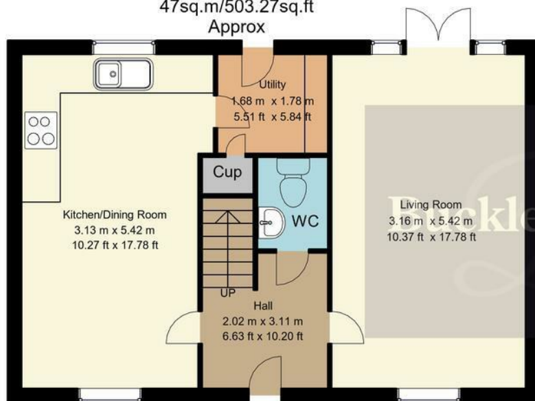
Ground Floor 47sq.m/503.27sq.ft Approx